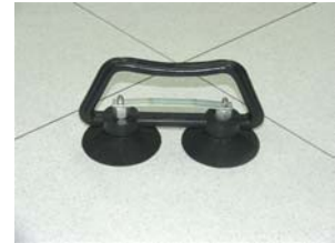
Product Code DBLCUP